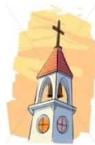
TABLE TALK: This group for all meets every Wednesday afternoon

BELL RINGERS: There is a peal of bells that welcomes local people to our service on Sunday morning. The team practise on a Monday evening and would welcome anyone wanting to take up this activity.